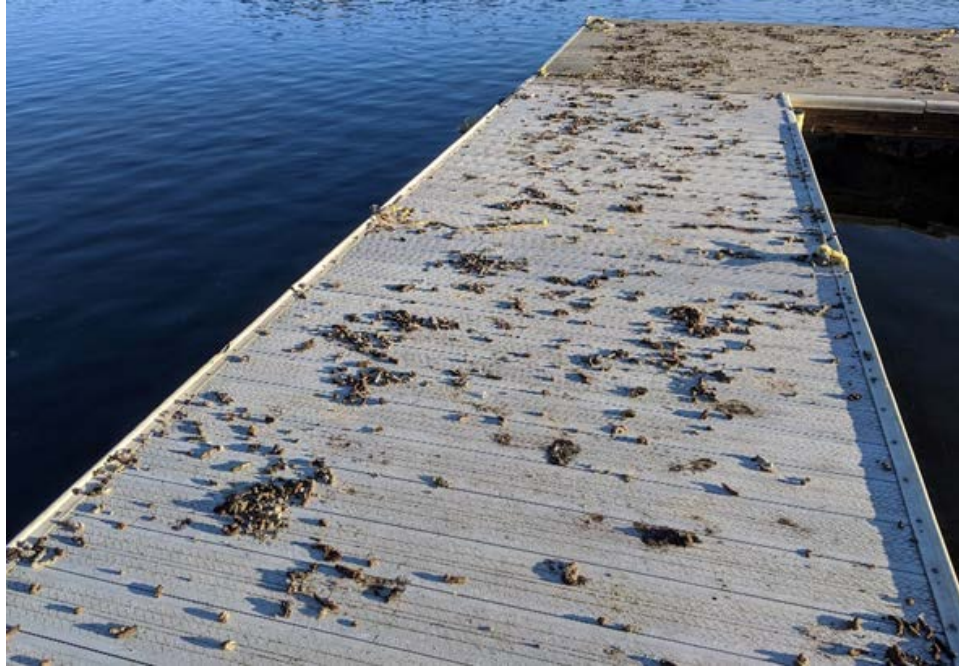
Figure 3. Geese feces on a marina dock, spring 2021.

More intensive geese management is warranted when Canada geese damage golf courses and community parks; reduce water quality; and endanger human life at beaches, roads and airports. Key thresholds that drive more intense activity and more drastic measures include: