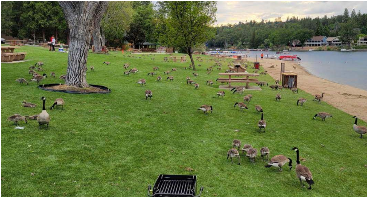
Figure 1. Canada Geese grazing the lawn at the Marina swim area, spring 2022.

Canada geese are the largest geese in the world, weighing up to 14 pounds and having wingspans up to 5 feet. They typically eat aquatic plants and grains, and occasionally eat fish and insects. They mostly eat grasses, so manicured lawns are attractive. Geese provide ecological services such as dispersing insects and seeds, feeding predators, and recycling nutrients. But in many areas their disservices outweigh their services (Buij et al., 2017).