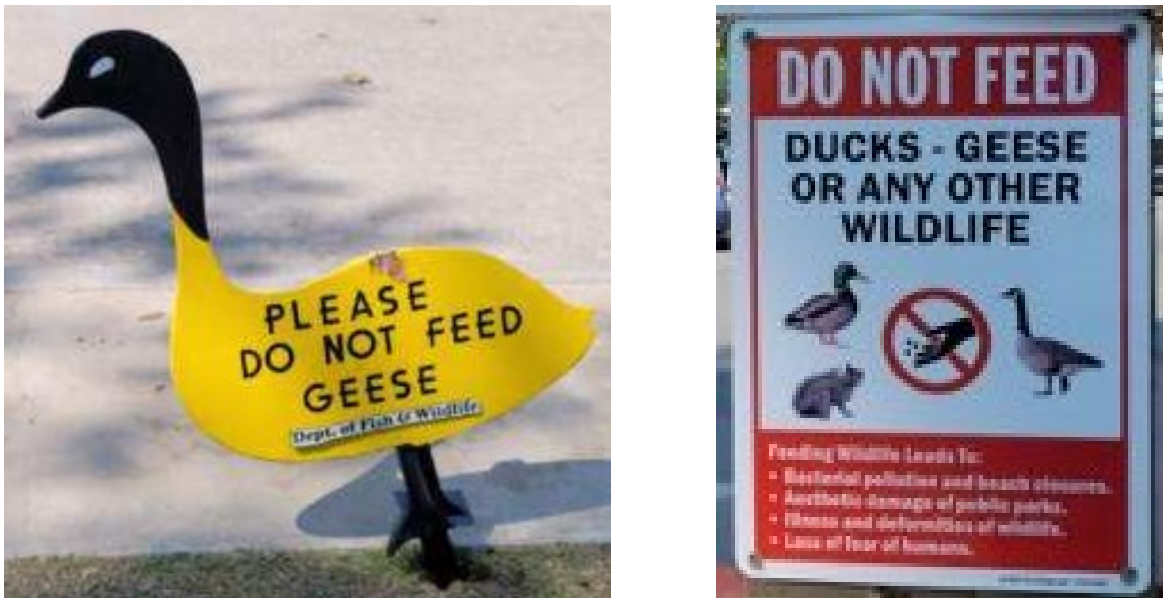
Figure 4. Signs posted at prominent at PMLA lake facilities.

PMLA posts signs at all lake access facilities. The key message, consistent with those described in section 2.1, is to not feed geese or other wildlife ( Figure 4 ). Warning signs are posted when the beach areas are closed because of pathogen indicator exceedances. The signs are regularly ignored. Members and guests continue to feed the geese and other wildlife.