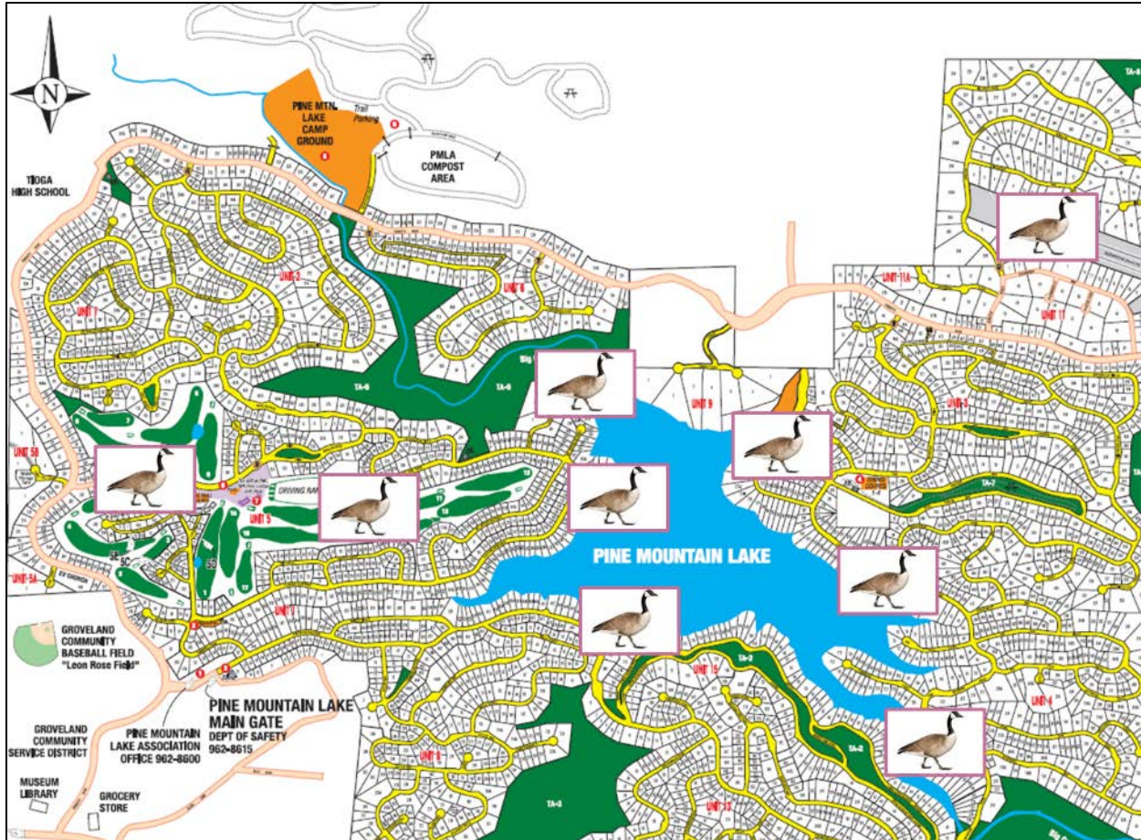
Figure 2. Map of Pine Mountain Lake community. Goose images indicate locations where geese are often problematic.

Geese are problematic because they are both a nuisance and a hazard in multiple ways: