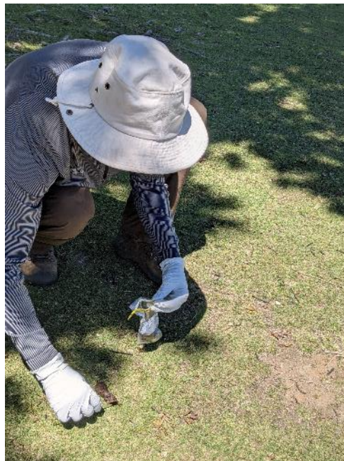
Figure 6. Geese feces sampling with protective gloves into a sealed plastic bag for delivery.

PMLA sampled geese feces on two occasions during the summer periods in years 2021-2023 and tested them qualitatively to screen for the presence of Escherichia coli O157:H7 and Shiga Toxin Producing E. coli (STEC; also known as Shigella spp). Pathogens using an FDA-approved immune-assay. Samples were collected from one beach site (Marina or Dunn Ct.) and the golf course (such as the pond by the corp yard), as demonstrated in Figure 6 .