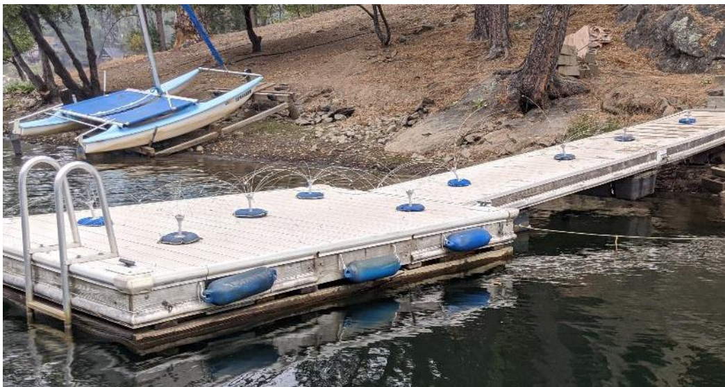
Figure 5. An exemplary lake dock with geese deterrent metal "spiders".

Along the lake shoreline, many dock owners have installed physical deterrents such as shown in Figure 5 . Docks with deterrents seem to have much less feces than docks without such devices.