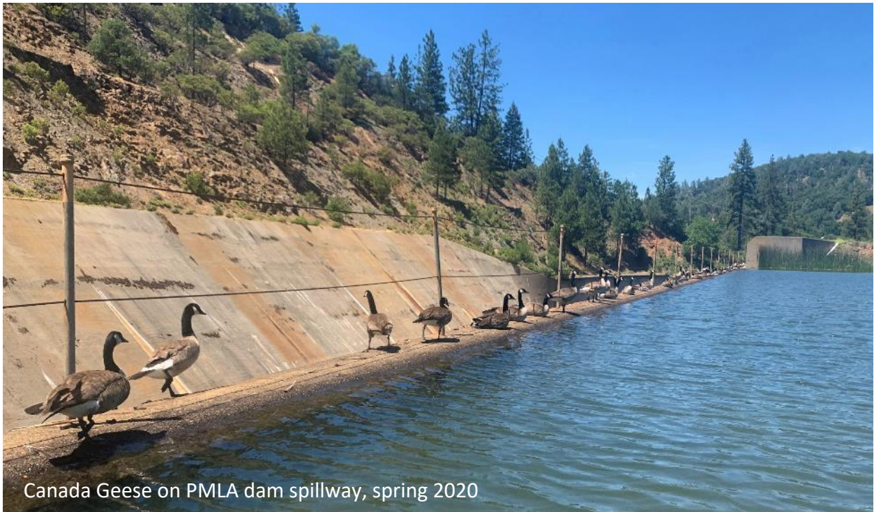
Canada Geese on PMLA dam spillway, spring 2020