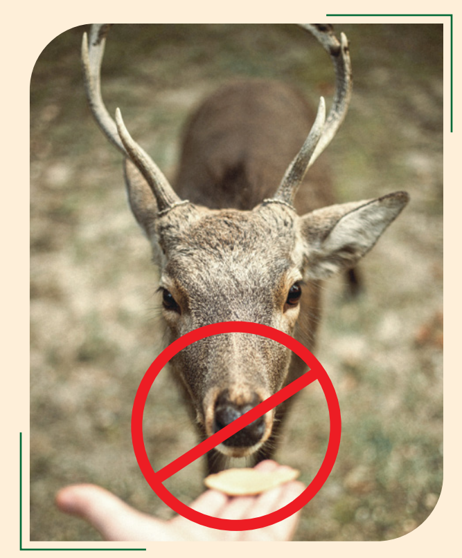
(Please do not feed or approach the wildlife)