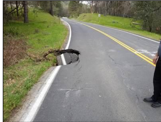
The second storm opened the cracks that were found on 4/4/2018 , and created a sink hole.

The County submitted the Initial Damage Estimate on 3/30/2018 to Caltrans. The County performed a site visit with Cal OES on 4/4/2018 and found longitudinal cracks forming. A second visit with FEMA and Cal OES was conducted on 4/10/18 .