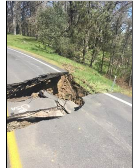
This sinkhole continued to open and became a loss of roadway on 4/15/2018 .

The County Environmental Health Director, met with the Groveland Community Services District (GCSD) and found damage to the sewer and water lines.