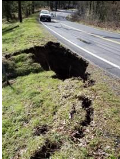
Initial damage assessment identified 3/23/2018 .

The County submitted the Initial Damage Estimate on 3/30/2018 to Caltrans. The County performed a site visit with Cal OES on 4/4/2018 and found longitudinal cracks forming. A second visit with FEMA and Cal OES was conducted on 4/10/18 .