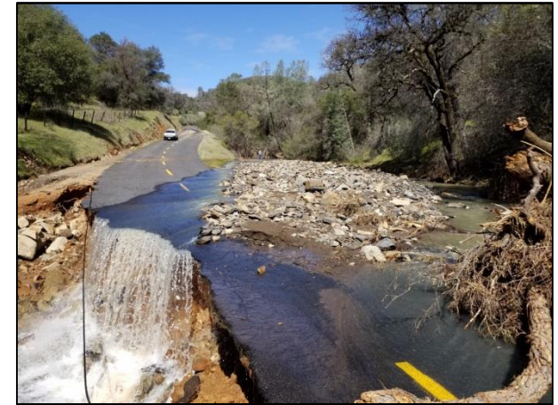
Priest Coulterville Road, Location 1 (of 5): Cobbs Creek