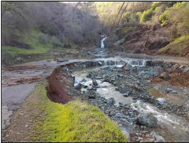
Marshes Flat Road at First Creek