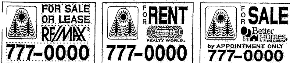
Figure 2. Sign Specifications I